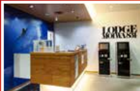
24-Hour Front Desk

Lodge Moiwa 834 is designed for comfort and convenience, featuring: